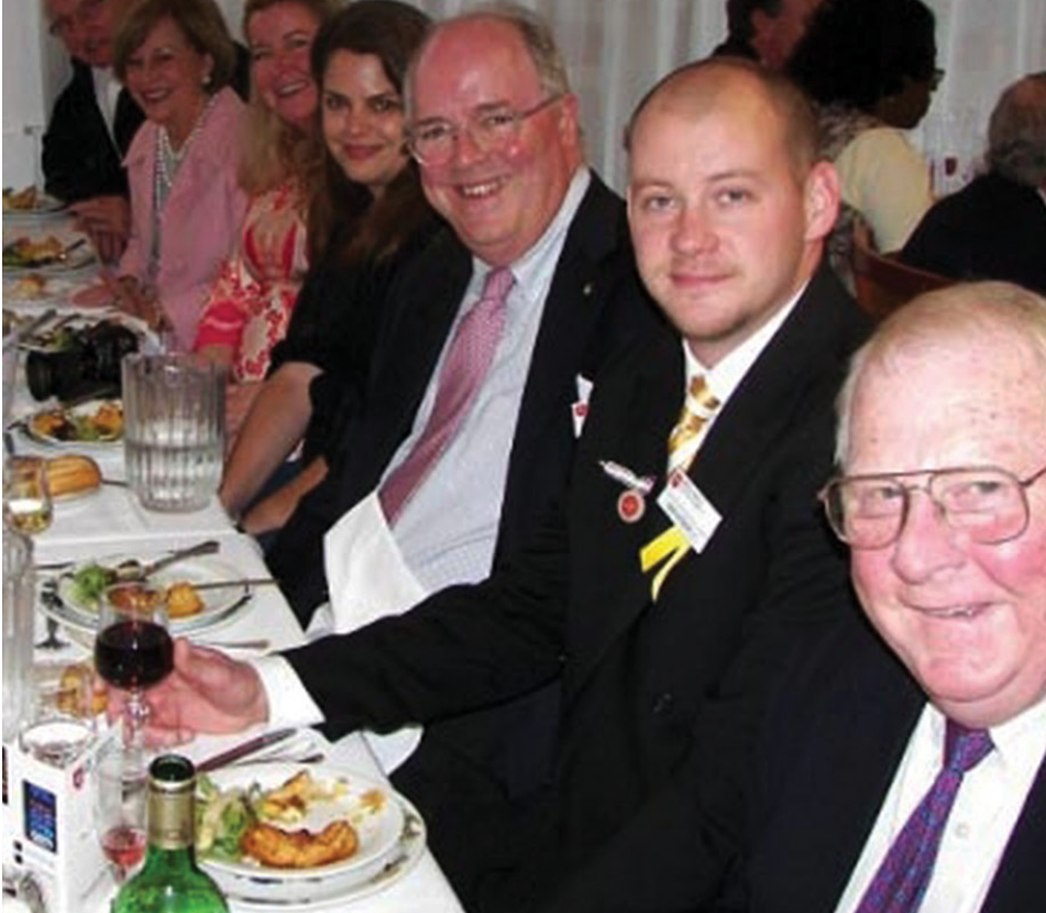
Yellow team members gather for dinner at Lourdes