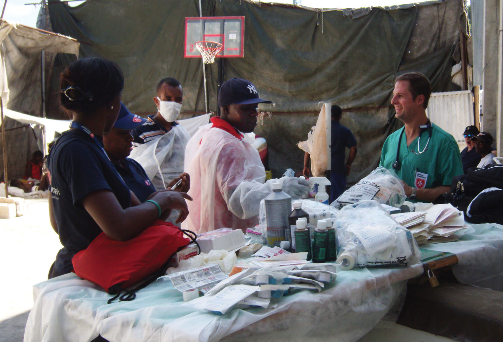
The Order's International Relief agency Malteser International set up emergency clinics in urban areas near the Haiti earthquake's epicenter.

to be used to support the Lourdes pilgrimage. We are very grateful to all of our members who have included the Order of Malta – Federal Association as part of their planned giving.