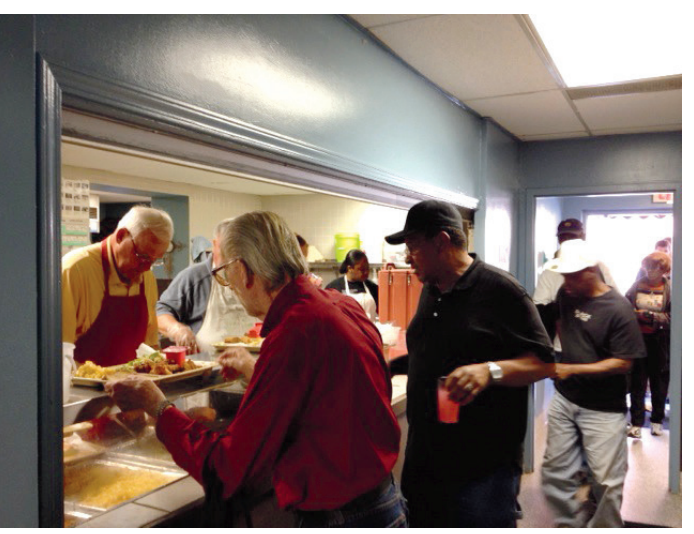
Kansas City members serving guests at the St. James Place Food Kitchen

At Our Lady of the Angels Mission on the west side of