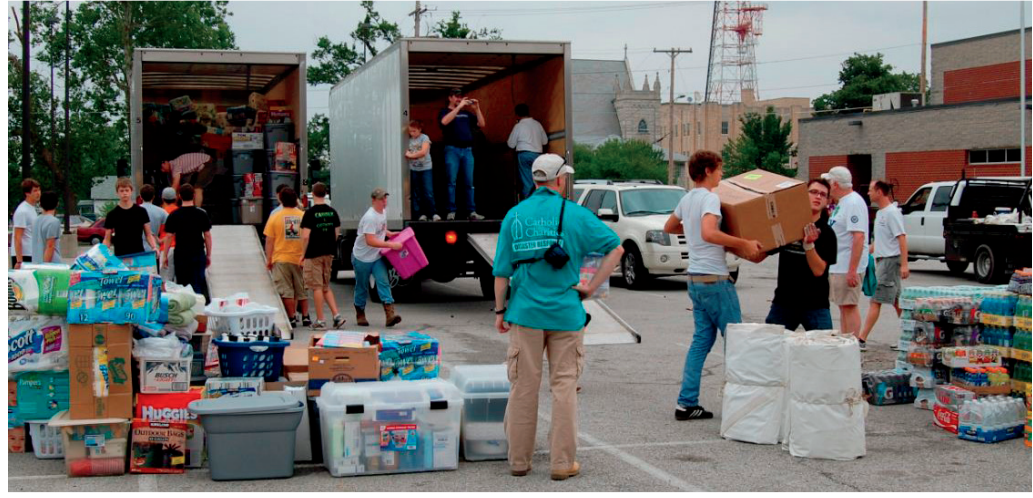
Joplin, MO-Relief supplies after tornado