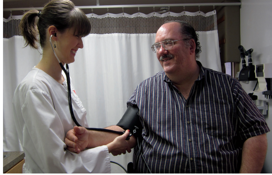
Volunteer treating patient at Malta House of Care Foundation-Hartford, CT

Members of the Baltimore Region currently cook and serve dinner monthly to approximately 150 women and children at My Sisters Place Women's Center, an outreach of the group home for formerly homeless women. The center is an invaluable resource for women, offering health information, return to work programs, and financial planning.