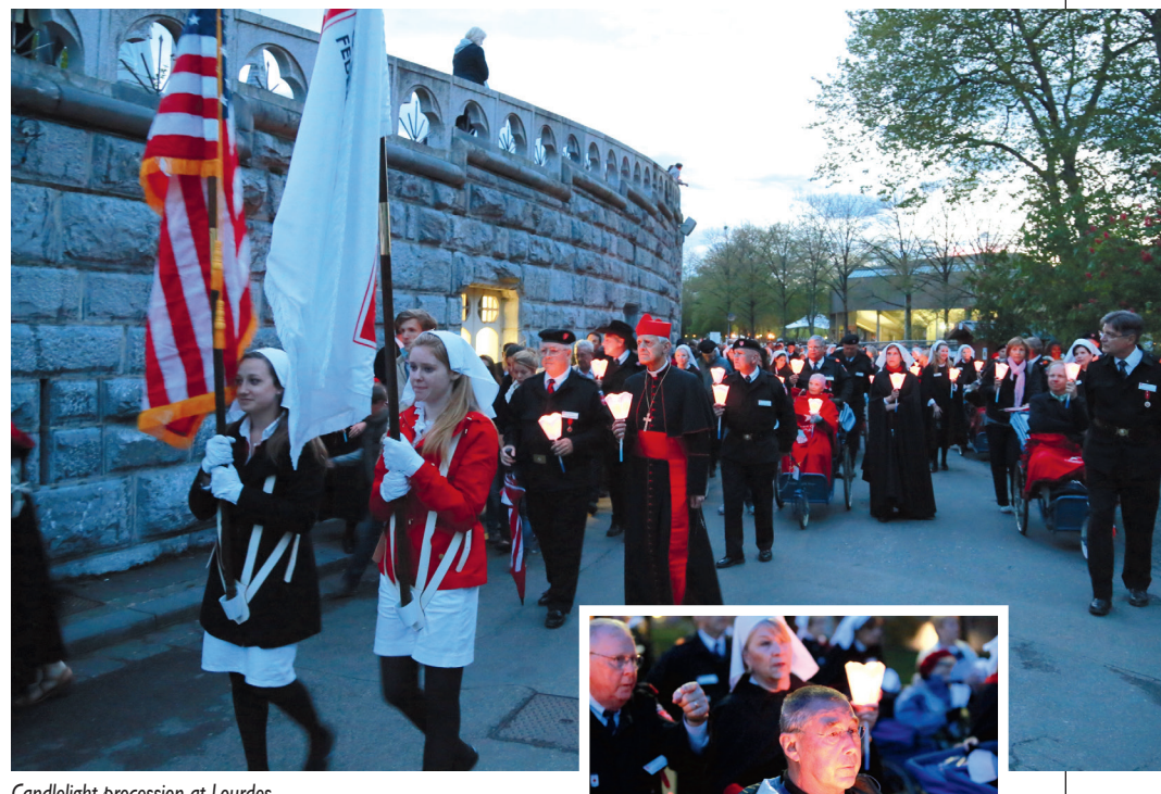
Candlelight procession at Lourdes

Before every activity the group gathered in the cramped, semi-covered carport behind the hotel. There 300 hundred people walked purposefully in every direction, assembling 50 voitures with malades. With a steady rain falling during many mornings, first time pilgrims doubted this would ever work. Yet each time, everyone was lined up, out the door, and at the venue right on time. Some thought this was a miracle while others attributed it to the decades of experience and calm presence of the six Team Leaders whose job was to keep