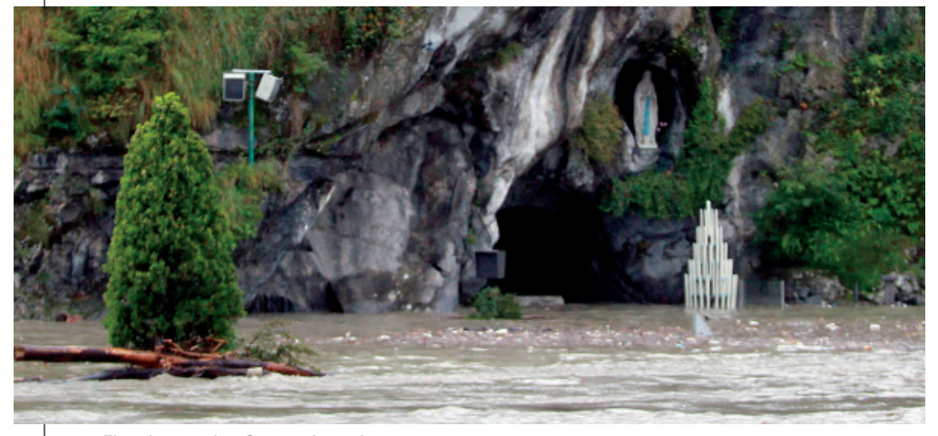
Flooding at the Grotto, Lourdes

Flood waters ravaged Lourdes, France during 2012. Pilgrimage facilities were threatened and many domain structures were impacted. In concert with Malta chapters around the world, the Federal Association Board provided an initial grant of $10,000 to a fund designated for the restoration of these blessed grounds.